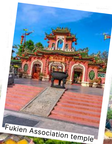
Fukien Association temple

Suggested flight: SQ172 SIN DAD 09:15 11:10 or VJ970 SIN DAD 11:15 13:05 (Airlines excluded)